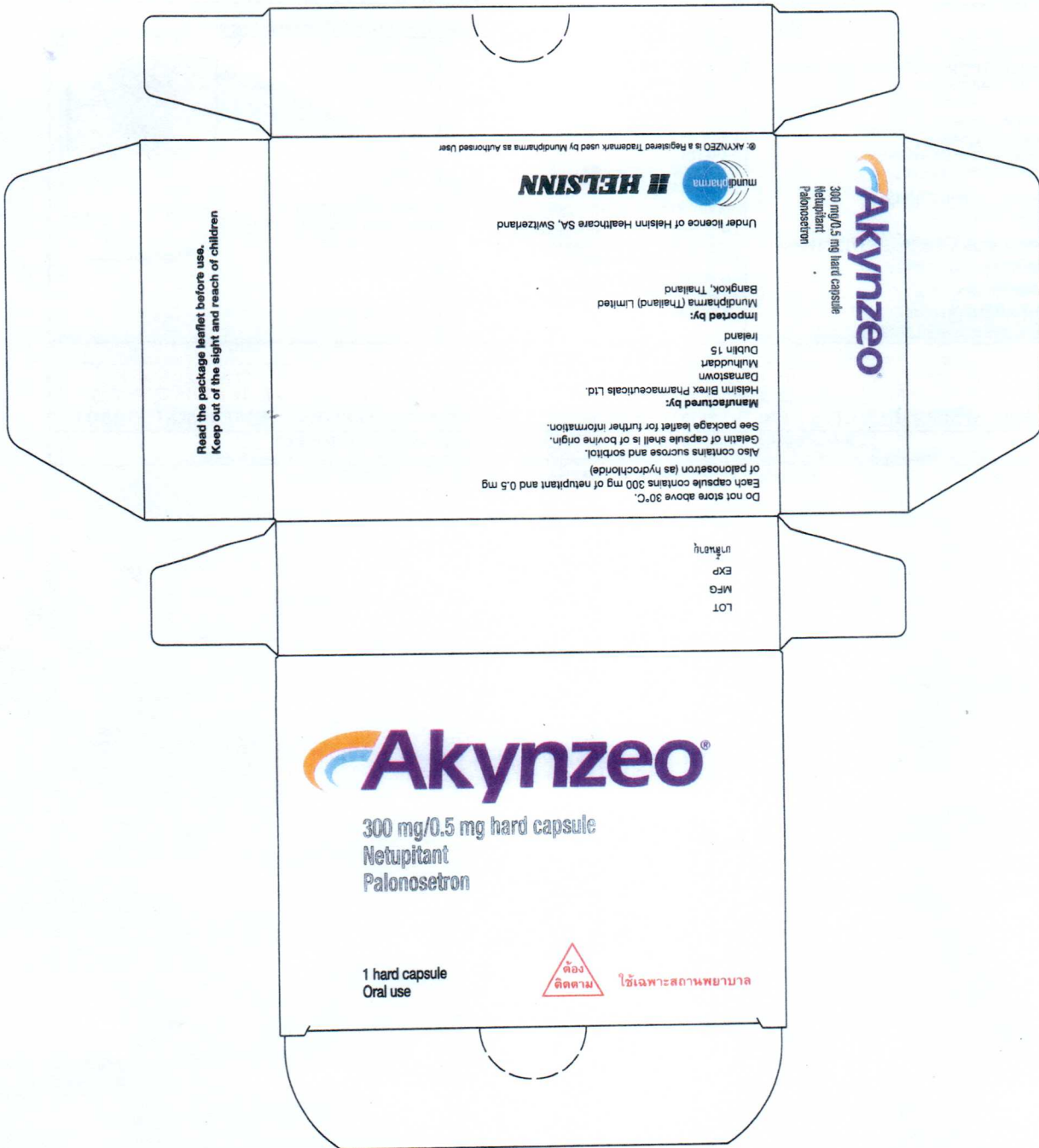
Outer carton Akynzeo 300_0.50 mg Capsule